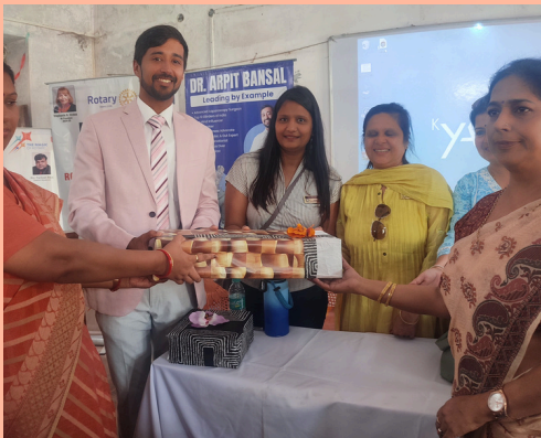
Talk on cervical cancer