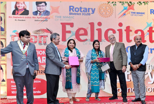
100% Donour Award