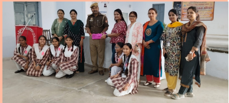
Talk on Traffic Rules